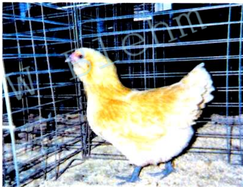
Milton Dyer's Reserve Variety Blue wheaten cock at the State Meet in Little Rock, Arkansas.